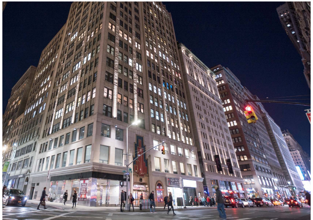
499 Seventh Avenue has taken advantage of the Garment District Avenue Lighting Program and has installed the GDA recommended security (down) lighting and the facade (up) lighting fixtures.

The GDA also encourages Avenue facing property owners to enhance their buildings with façade up-lighting , which the GDA will help facilitate but is not subsidized.