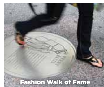
Fashion Walk of Fame

W 41st), Gregory's Coffee (551 7th Ave), Culture Espresso (72 W 38th), or Ramini Espresso (265 W 37th) to get a morning caffeine fix before your day of exploring. Don't be surprised to find yourself returning to refuel during the day.