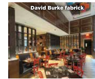
David Burke fabrick

than our rooftop bars: Monarch Rooftop Lounge (71 W 35th), Sky Room (330 W 40th), The Skylark (200 W 39th), Top of the Strand (33 W 37th), Refinery Rooftop (63 W 38th), or Spyglass at the Archer Hotel (45 W 38th).