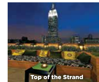
Top of the Strand

While you're there, take in the latest Public Art installation and enjoy the beautiful plantings in this urban oasis.