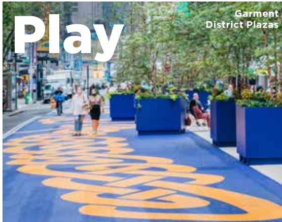
Garment District Plazas