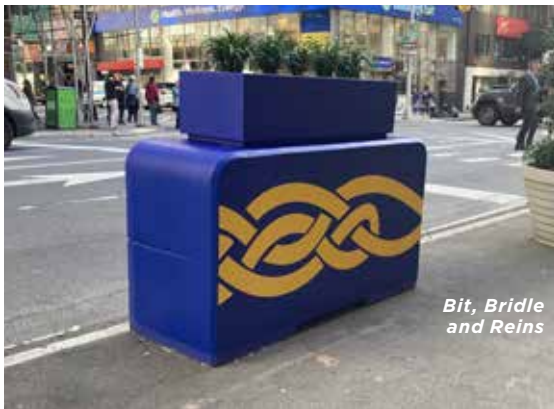
Bit, Bridle and Reins

The GDA presented 13 installations this year, many of them by local artists, in the Garment District Spaces for Public Art at 315 West 38th Street and The Kaufman Arcade at 132 West 36th Street. One particular installation was a personal favorite of the GDA. February’s Reduce, Repair, Reclaimed was created by Hinz Guitars, an initiative started by brothers who are both part of our clean team. Hinz recovers, refurbishes and sometimes redesigns discarded